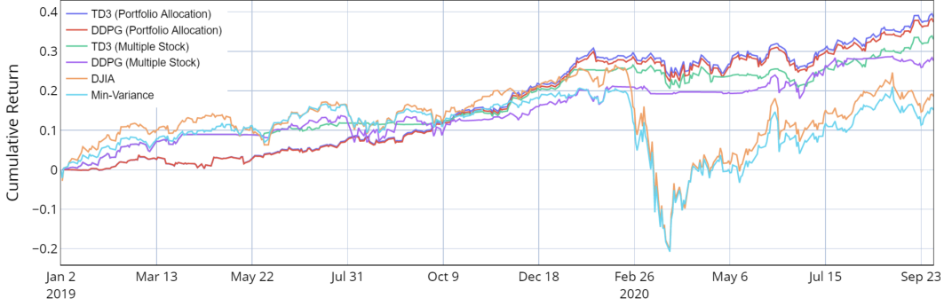
Figure 5: Performance of multiple stock trading and portfolio allocation using the FinRL library.