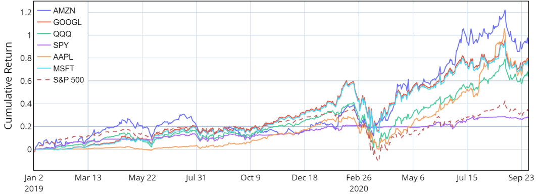
Figure 4: Performance of single stock trading using PPO in the FinRL library.